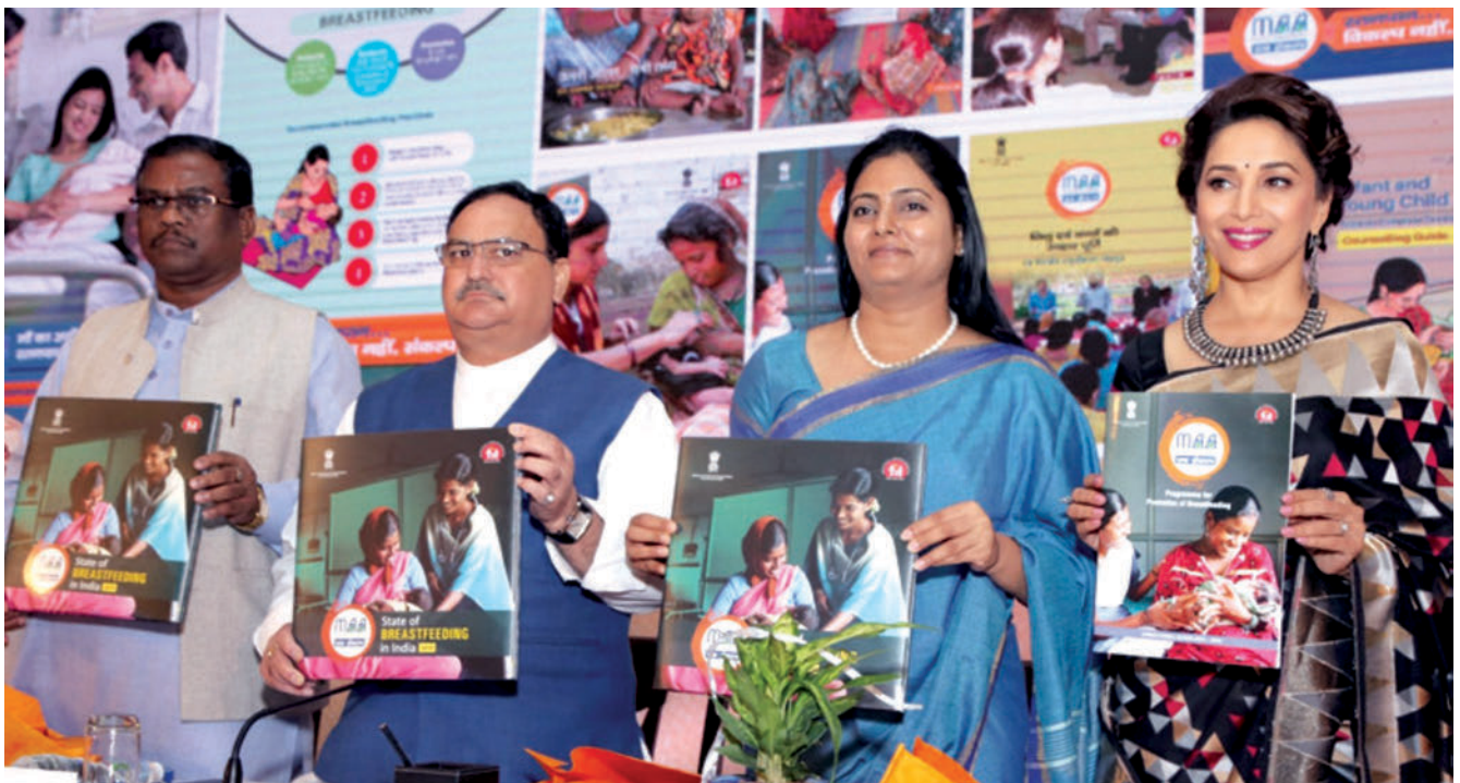
Mothers Absolute Affection: Ek Sankalp